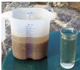
Treated water quality – after tertiary treatment